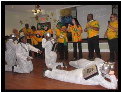
Harmonettes Vocal Choir singing the Kill Joy Patrol to their death!