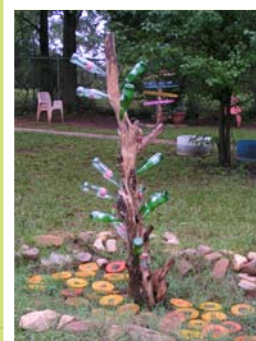
Bottle Tree made in the horticulture classes

The bottle tree was a fun work of art! We have also cleaned the outside fences from vines and we decorated them with Olympic circles, painted black, red, blue, green and yellow. A paddle post pole was put up in yard of art center with words love , joy , peace , and patience on them. We spruced up other areas by displaying our decorated bird houses on surrounding oak trees, displaying an old chair that was painted red, white and blue and used as a planter. We plan to grow and produce a few items to sell at next years Farmer's Market. We want to thank Greg Eilers and Katie Schmitt for helping us.