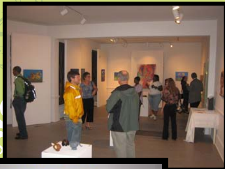
Left: Opening reception